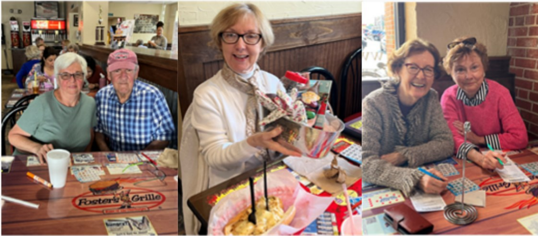
Garden Party themed Bingo - Mark your calendars for upcoming Bingo nights! September 11th, and December 4th!