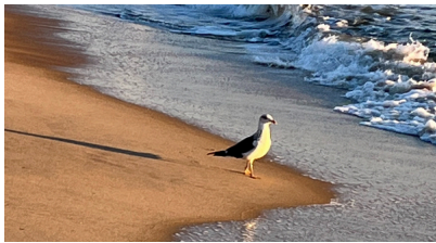
Outer Banks North Carolina

“My favorite vacation spot is the Outer Banks, NC in the fall. There are picturesque long sandy beaches, friendly people, fine dining, sunsets over the sound and lots of opportunities for water activities. Our family has sailed Hobbie Cats on the sound, fished and kayaked. We have seen everything from dolphins to the Milky Way. I have hundreds of shells sitting around my home to remind me that the beach magic is waiting for me.”