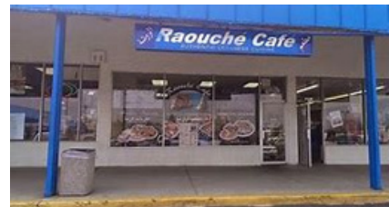
Raouche Cafe Falls Church, VA

“This Lebanese restaurant is awesome. My family loves eating here. The food is reasonably priced and absolutely delicious!”